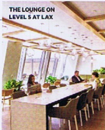
THE LOUNGE ON LEVEL 5 AT LAX

on your way. The new Los Angeles Business Lounge on level 5 of the renovated LAX can already accommodate 400 passengers flying Qantas, British Airways and Cathay Pacific. By early next year that will be 600 passengers and a family zone when the business lounge is completed in tandem with a new Qantas First Lounge. qantas.com