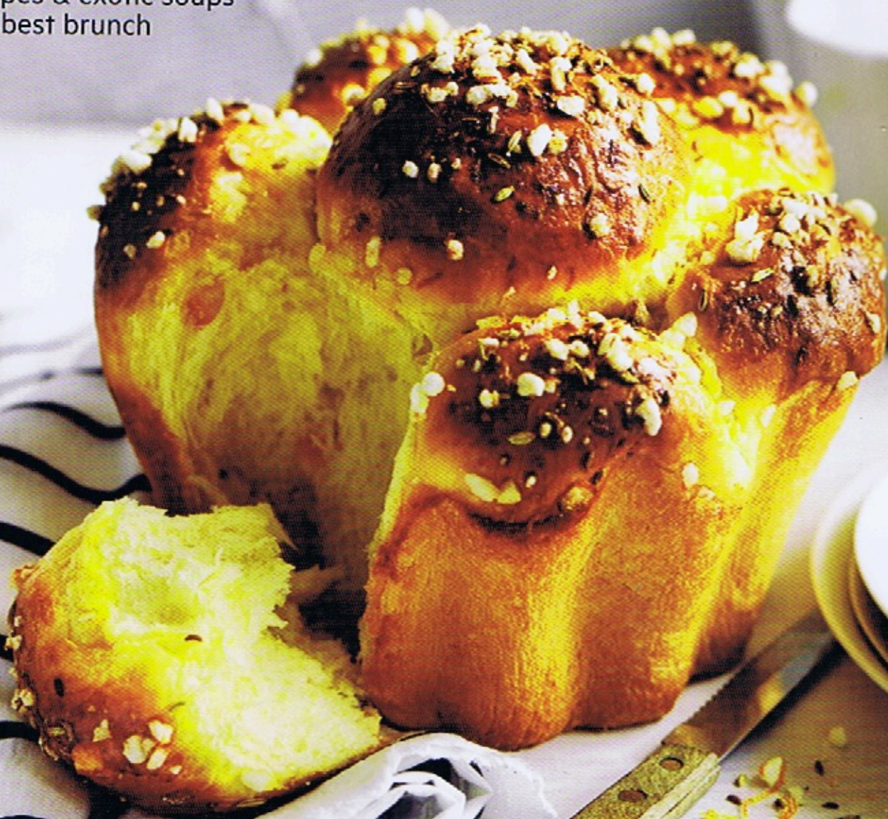
Fennel and orange sugared brioche

RUSTIC FAVOURITES Pea & ham soup, APPLE DANISH, DUCK-FAT SCONES,